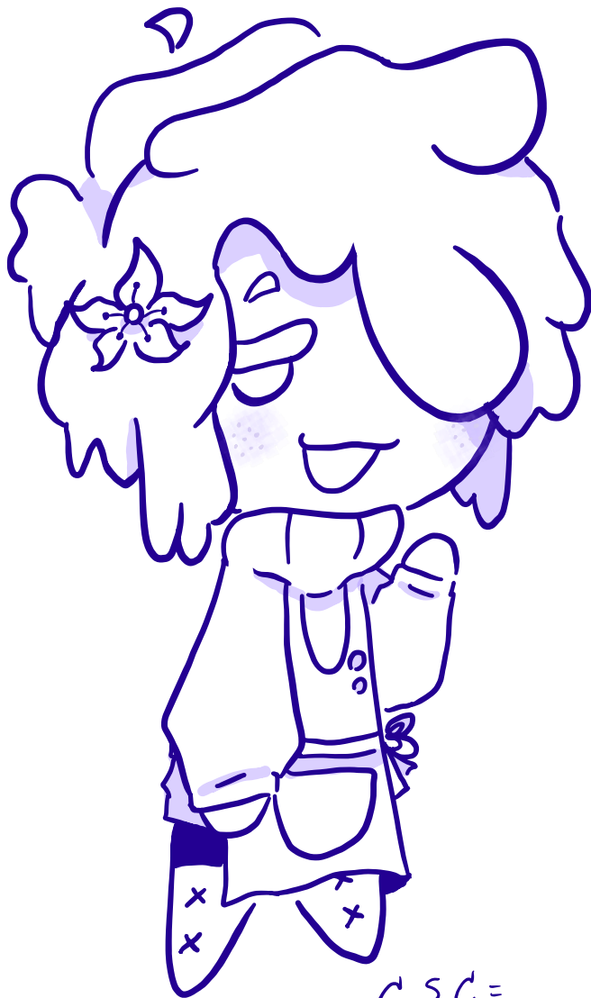
C.S.C = Crystal Star Cookie